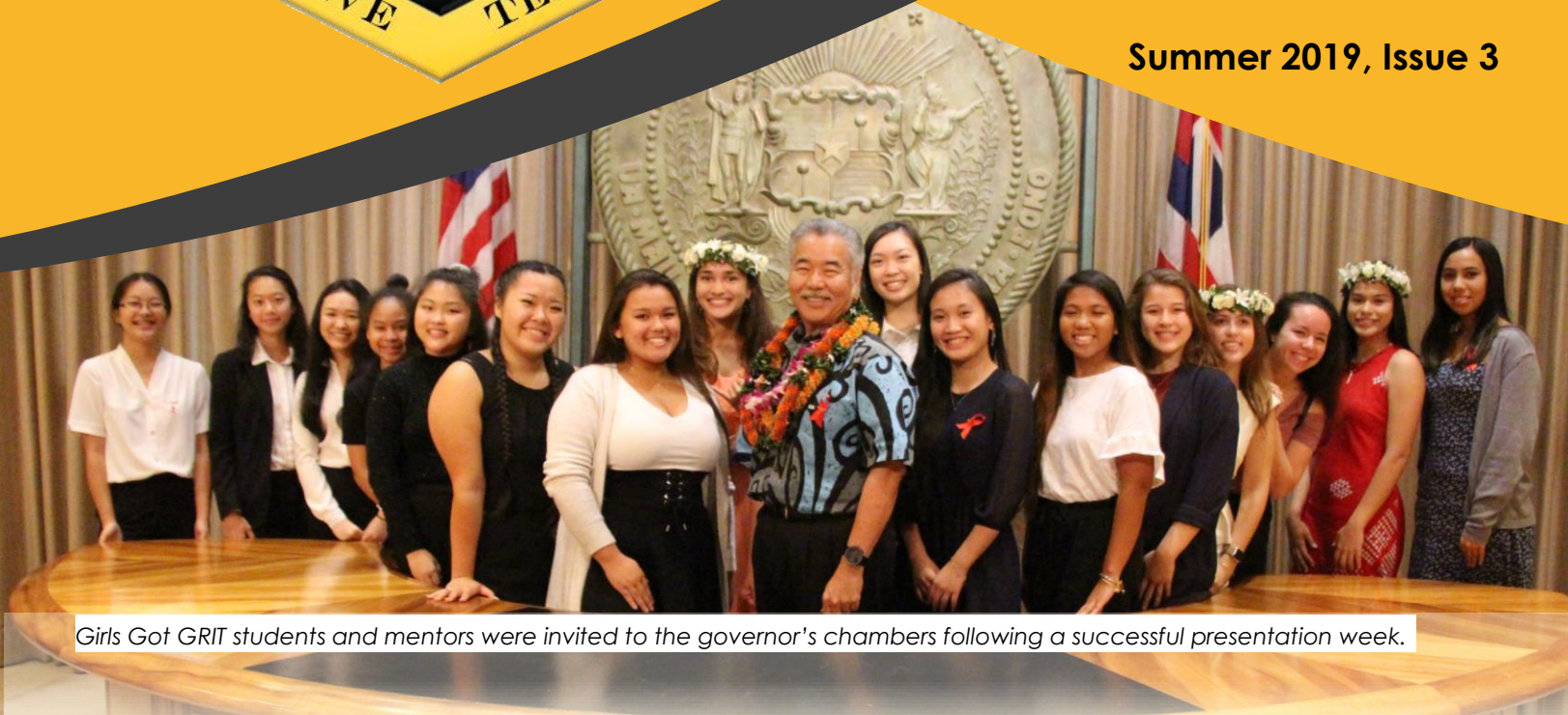
Girls Got GRIT students and mentors were invited to the governor's chambers following a successful presentation week.